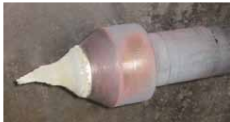
Stem plug wear: depending on the application or how abrasive the fluids are, internals may wear faster.

NOTE: Each Hydroheater is custom engineered, if new internals are needed, allow for manufacturing leadtime.