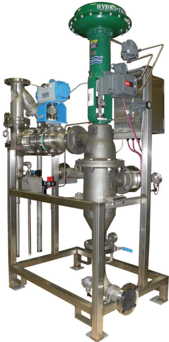
Hydro-Thermal standard EZ Heater skid assembly.

Customers can find help by contacting our help desk at (800) 952-0121 or info@hydro-thermal.com . Download your specified EZ Heater installation, operations and maintenance manuals from our online Knowledge Center.