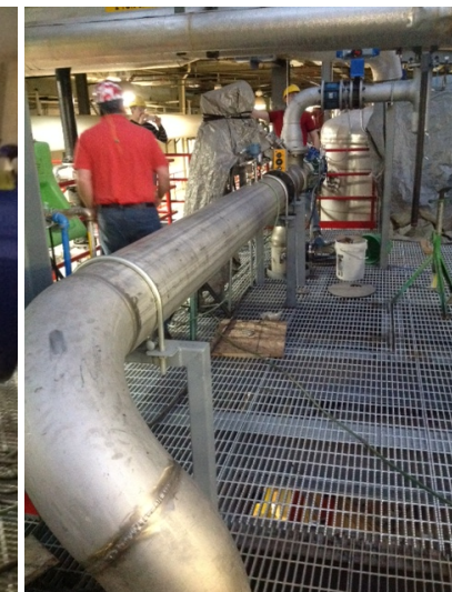
Return to Pump